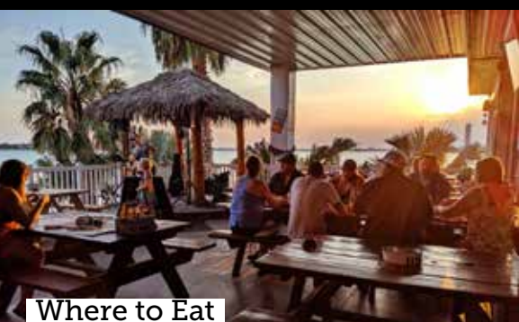
Where to Eat

No matter what your tastebuds are in the mood for, you will find it in Houston's Bay Area.