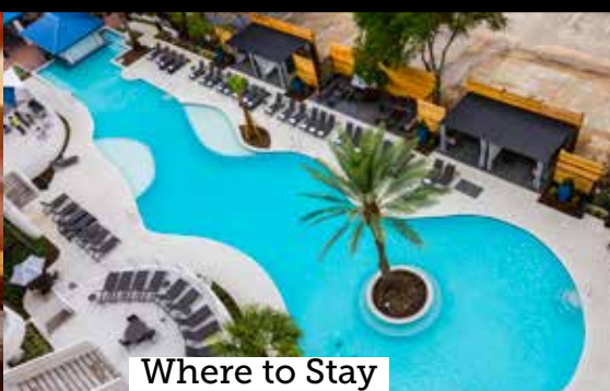
Where to Stay

Mediterraneo Market & Café in Nassau Bay offers up a variety of classics to enjoy on their patio with live music and belly dancers on the weekends. In League City , try Craft 96 and Main Street Bistro . Some favorite local spots to dine by the water include Cabo, Barge 296, Schafer's, Pier 6 , and Boondoggle's .